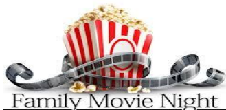
Family Movie Night

The GPS PTO would like to give a big THANK YOU to everyone who came out and supported our Movie Night. We were so amazed and glad to see so many of our community come out and support our schools. We appreciate your support!!